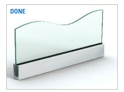
Roll in the Glazing Gasket and you're done! The TAPER-LOC® System makes it quick, clean, and simple.