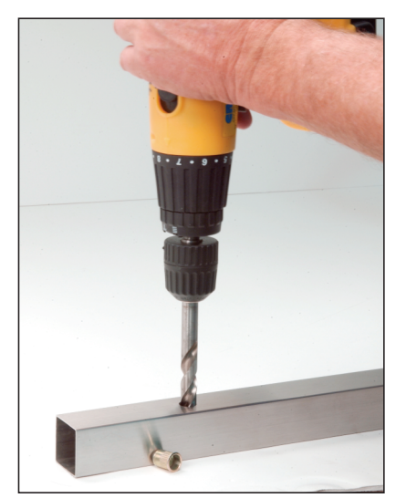
First, drill the appropriate size hole for the Rivet-Nut into your round post or square tube