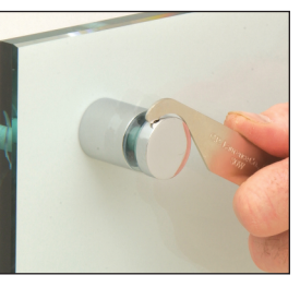
Tighten Cap with Cat. No. SOW Wrench