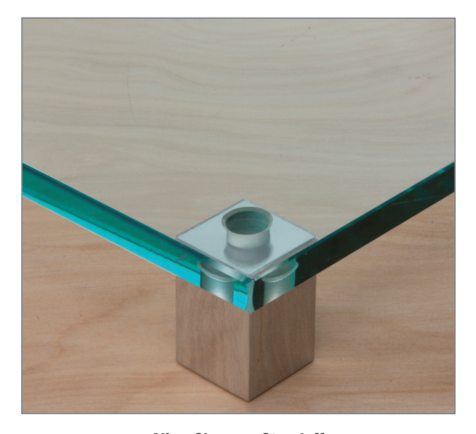
Align Glass on Standoff