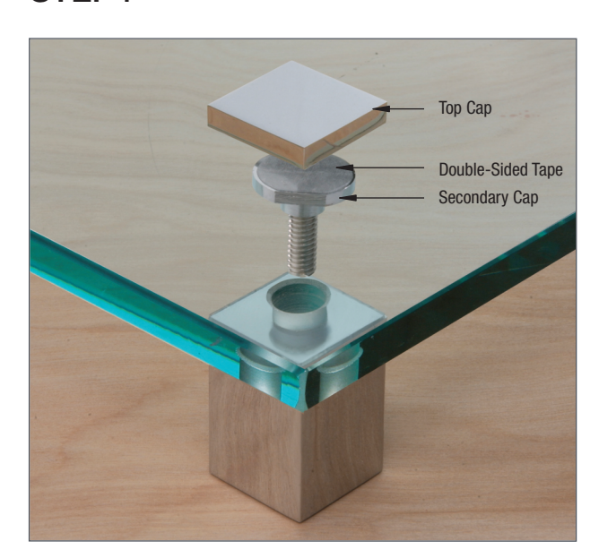
Tighten Secondary Cap, Remove Backing on Double-Sided Tape, Align and Install Top Cap

NOTE: Due to the diversity of applications, weight limitations for Standoff Systems are dependent upon wall or substrate anchoring and material strengths.