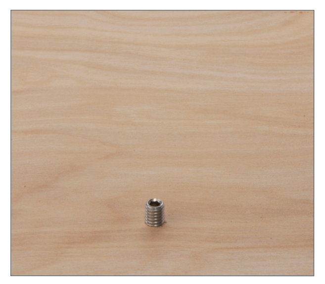
Set Fastener to Surface