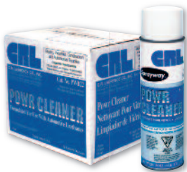
PWR22 Automotive Glass Cleaner