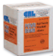
1217349 High Viscosity Urethane Adhesive