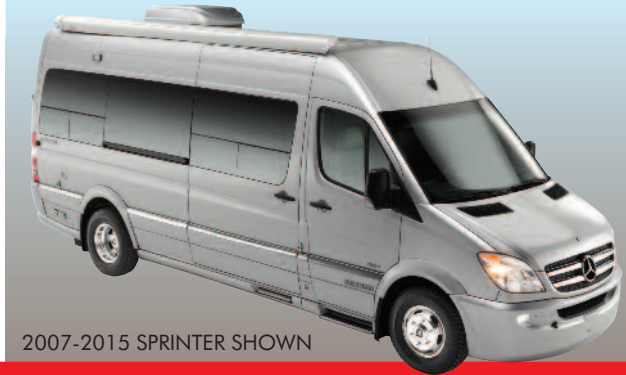
2007-2015 SPRINTER SHOWN