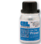
1214006 One Step Urethane Primer